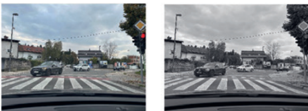
Figure 3. Original RGB image (left) converted to grayscale (right)

To create a grayscale image, you can either read the file directly in grayscale mode or if an RGB image is already loaded, convert it to grayscale using the cvtColor method from the OpenCV library (Figure 3).