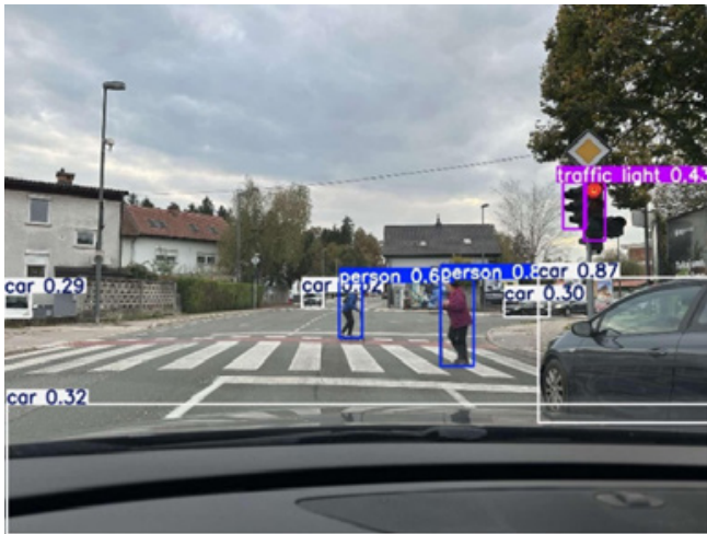
Figure 8. Object Detection using YOLOv8 Algorithm