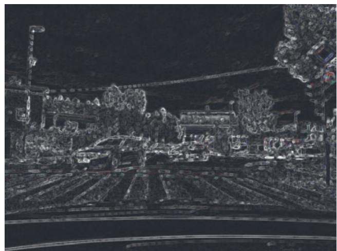
Figure 5. Result of edge detection on the image

This process involves locating the boundaries or edges of objects by detecting sudden shifts in shading within the image [15]. This technique is instru-