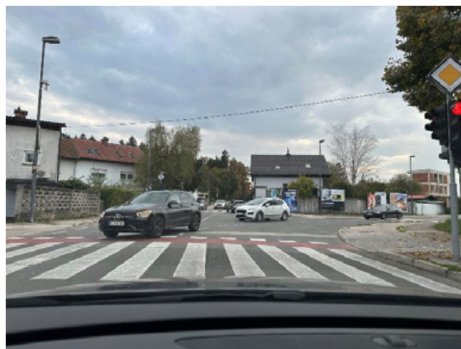
Figure 1. Image loaded in its original format

When loading an image, the initial step is to import the necessary library. Following this, the cv2.imread() function is invoked to load the image, and the resulting data is stored in the variable img . This function's parameters include the file path of the image and an integer that specifies whether the image should be loaded in color or grayscale (stored in the variable img_1 ). To display the loaded image in a new window, the cv2.imshow() function is called, which takes as parameters the name of the window and the variable containing the image data. Next, the waitKey() function is executed, which temporarily halts program execution until a key is pressed. Once a key is detected, the destroyAllWindows() function is called to close all open windows.