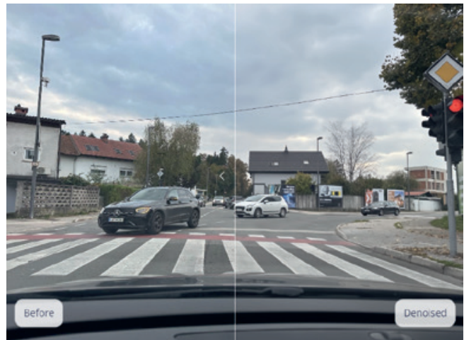
Figure 4. Result of noise removal from the image

One of the key challenges in image processing and computer vision is the removal of noise from images. The “denoising” process entails estimating the original image by minimizing the noise that may be present (Figure 4). Noise can originate from various sources, including sensors and environmental factors, making it often unavoidable in real-world applications.