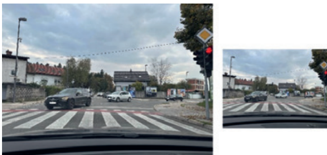
Figure 2. Size comparison: 50% reduction (right) compared to the original size (left)

Here’s a breakdown of the process [13]: The cv2.imread() function reads the specified file in cv2.IMREAD_UNCHANGED mode, returning a NumPy array containing the pixel values. The variable scaling_percentage is set to 50, indicating that the image will be reduced to 50% of its original dimensions (both width and height). img.shape[1] retrieves the width of the original image. int(img.shape[1] * scaling_percentage / 100) computes the new width, which represents 50% of the original width (Figure 2). The new size of the image is established with these calculated dimensions. The cv2.resize() function resizes the image img to the new dimensions stored in the variable new_image, returning a NumPy array. Finally, the resized image is saved to disk with the name “traffic_resize.jpg”.