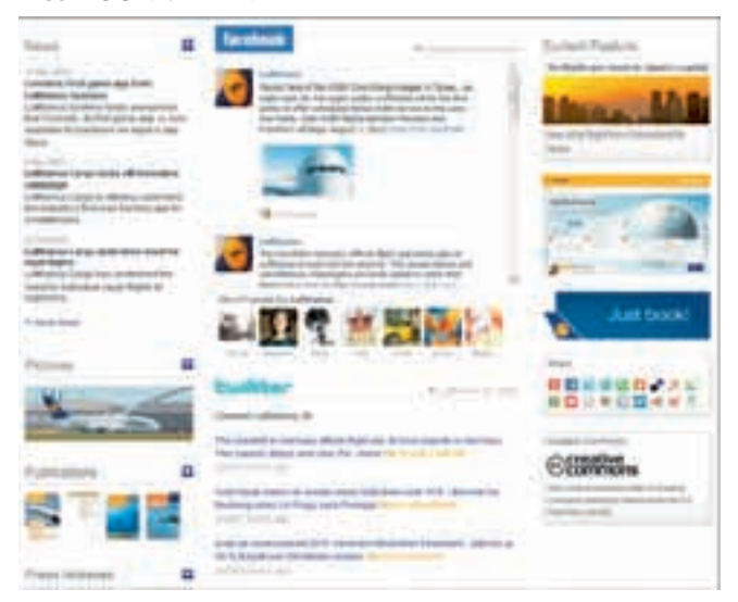
FIGURE 3 SMN EXAMPLE

SMN contains many features of traditional media sites such as different types of content, press releases, reports and pictures. On the SMN press and other, stakeholders can find information about top management, including photos and bios. SMN may contain press release and photo archives. One of the features of SMN is corporate calendar with dates for key announcements and key events. Besides all the traditional content, SMN will include more interactive features, as well as links to specific topics, which would be sent by e-mail or distributed through an aggregator. SMN can contain a multimedia library in addition to conventional photo library. In addition, there would be a section with a choice of RSS and links to sites for social bookmarking. SMN can provide a direct conversation about information or specific statements on the company's website.