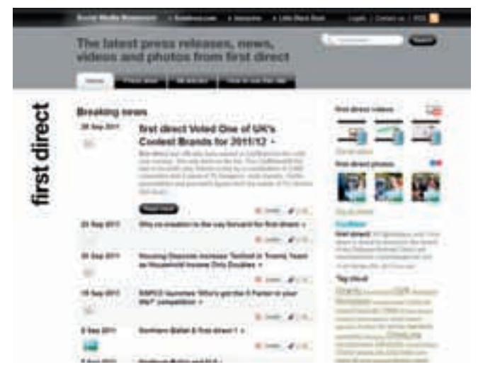
FIGURE 2 SMR EXAMPLE

Although it appeared different from standards for the SMR, there are common aspects that distinguish them from traditional press releases placed on the Internet. It is important to note that the SMR cannot be sent via e-mail journalists or bloggers. SMR is something which reveals or calls to see. SMR has links to variety of social media, social networks, bookmarking, tag