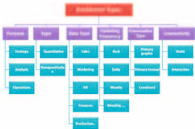
FIG. 3 DASHBOARD TYPES

Due to a large variety of the information tables application, they may be divided into several categories. One of the possible divisions is shown on the figure below: