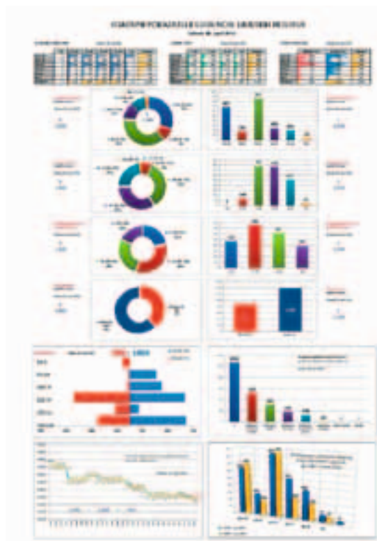
FIG. 5 INFORMATION TABLES IN USE IN THE TELEKOMUNIKACIJE RS

Below are the examples of the business reports the Author of the paper has created for the Telekomunikacije RS, for the purpose of making regular business analyses and reports, which may be considered to be the information tables.