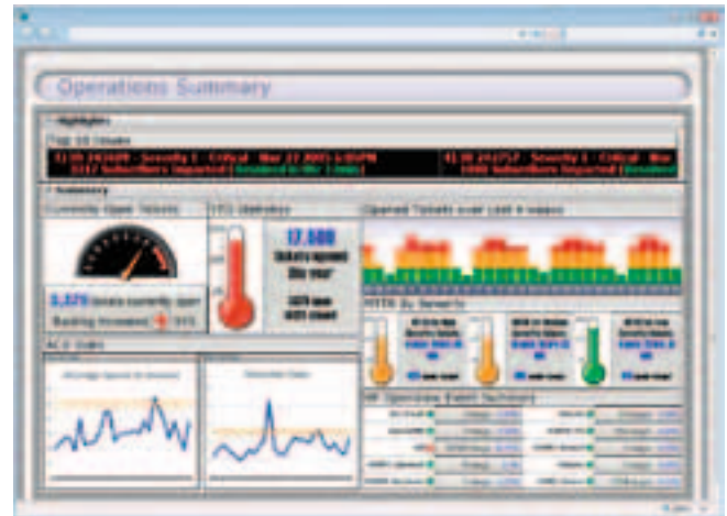
FIG. 2 INFORMATION TABLE- EXAMPLE 2[6]