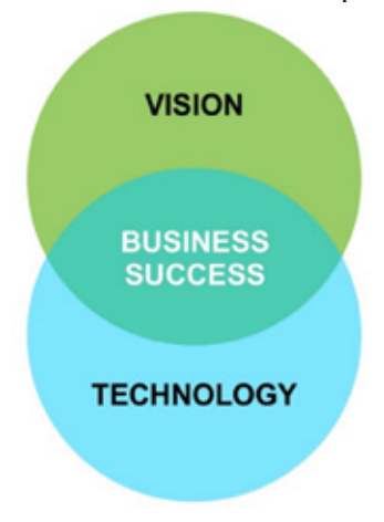
Picture 2. The interrelationship of vision and technology as an indicator of business success

Understanding technology is changing business and its basic business model is the starting point for transformation. Organizations that have introduced digitalization into their business are based on business improvement and building business intelligence systems, rather than on the application of individual technological solutions.