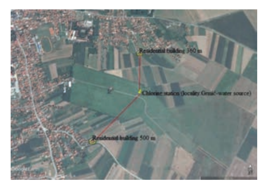
Picture 1. Position and distance of chlorine station from the first residential object

Chlorine station is located at an altitude of 92 m. The chlorine station is about 360 m away from the first residential building, north (Pictures 1). It is noticeable that chlorine is mainly used for disinfection of drinking water in this station. Since chlorine is a toxic material, thus, its dispersion can be dangerous for human health [Setareshenas et al., 2014, Hosseini, 2016].