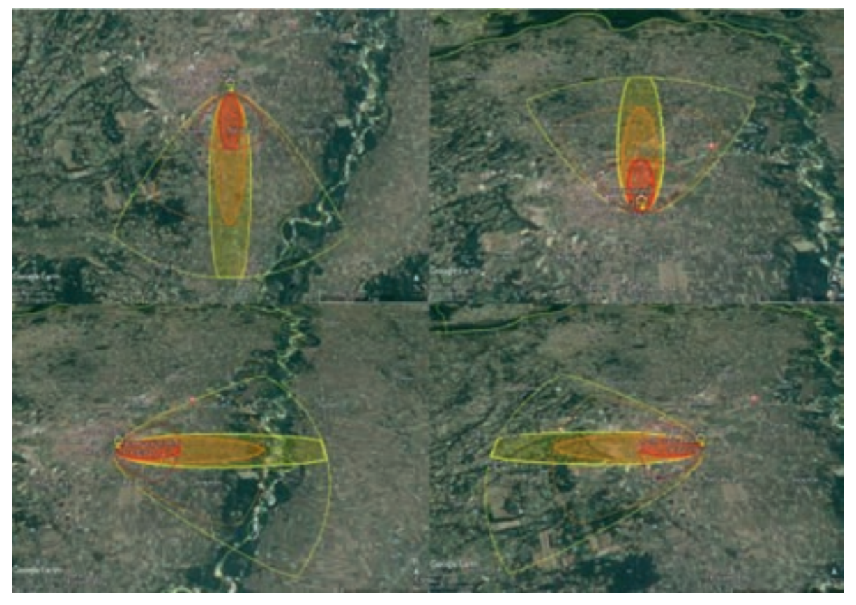
Pictures 4a, 4b, 4c and 4d. Simulation of the accident (south, north, east, west)

Simulation of the accident positioned according to the entered coordinates (44°45'01.17"N 19°14'06.03"E), rotated in the direction of the wind (south, north, east, west) (Picture 4).