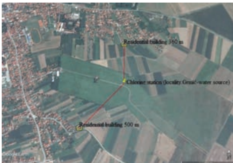
Picture 1. Position and distance of chlorine station from the first residential object

Chlorine station is located at an altitude of 92 m. The chlorine station is about 360 m away from the first residential building, north (Pictures 1). It is noticeable that chlorine is mainly used for disinfection of drinking water in this station. Since chlorine is a toxic material, thus, its dispersion can be dangerous for human health [Setareshenas et al., 2014, Hosseini, 2016].