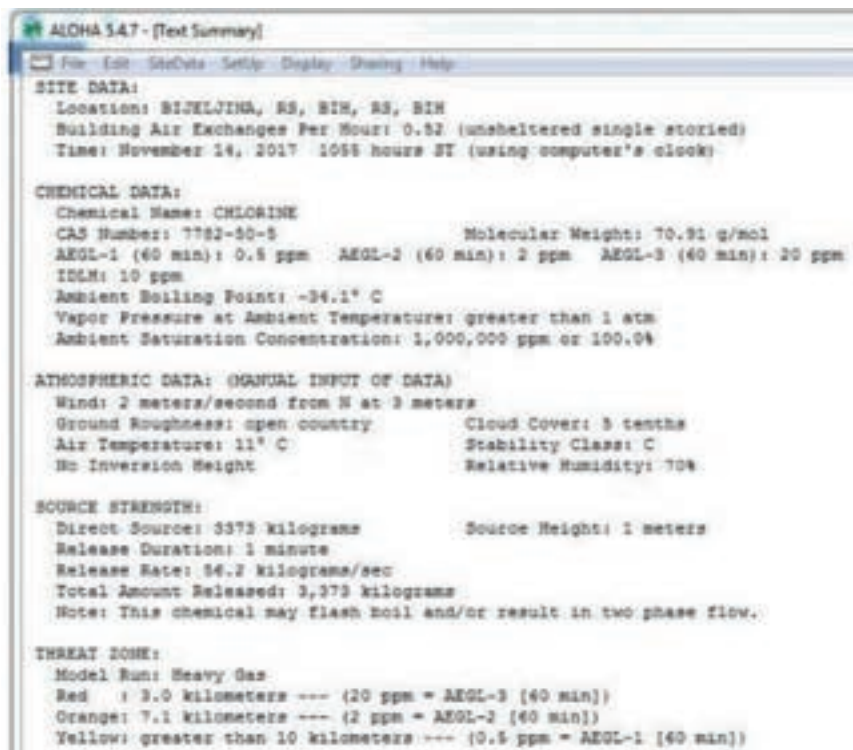
Picture 2. Entered data in software