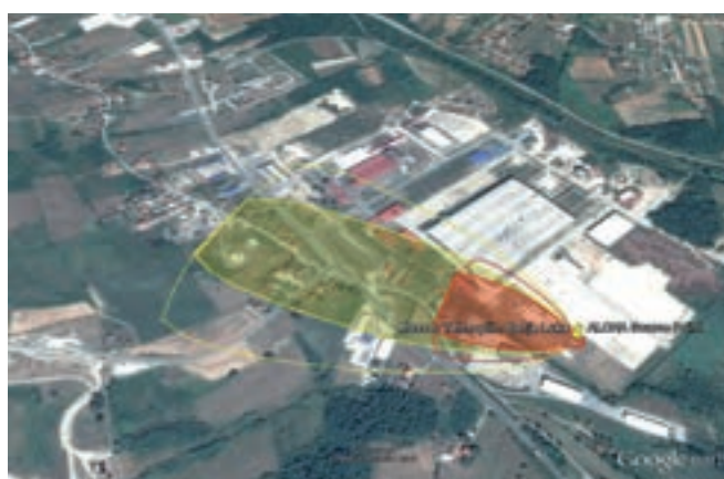
Picture 4. Iso-concentration lines flammable zones scenario of burning vapor cloud of propane