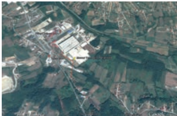
Picture 1. Position and distance of station from the first residential object

Propane station is about 200 m away from the first residential building, north (Pictures 1).