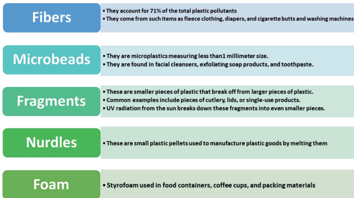
Figure 2: Types and distribution of secondary microplastics and their commercial use

Secondary plastics are large size and high-density plastic fragments in terrestrial and marine habitats (Weinstein et al., 2016). Weathering causes large plastics to break down into smaller pieces. Another significant process is the photodegradation resulting from the ultraviolet radiation in sunlight, that is causing the breakdown of chemical bonds in the oxidation procedure. Besides the sources, there are 5 types of microplastics i.e. fibers, microbeads, fragments, nurdles and foams (Fischer and Scholz-Böttcher, 2017) (Fig. 2.)