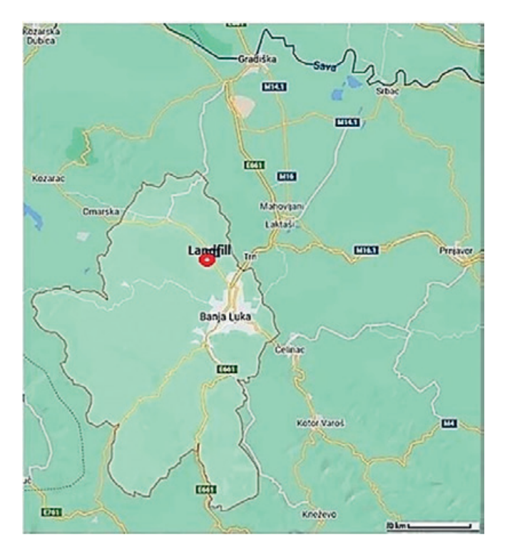
Figure 1. The position of cities and municipalities in relation to the Banja Luka landfill

from three cities (Banja Luka, Gradiška and Laktaši) and five municipalities (Srbac, Čelinac, Kotor Varoš, Kneževo, Prnjavor) (Figure 1). The total number of inhabitants in the region is 370,329.