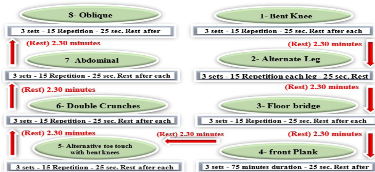
Figure 1. Core Muscles Strengthening Workouts Protocol

The experimental group underwent intensive training with core muscle strengthening workouts for a period of 6 weeks (three times per week) within the training unit during the preparation period, and the physical training is shown in Figure (1). However, the control group did not undergo the same intensive training for core muscles, but they trained as usual, which included a variety of muscle groups.