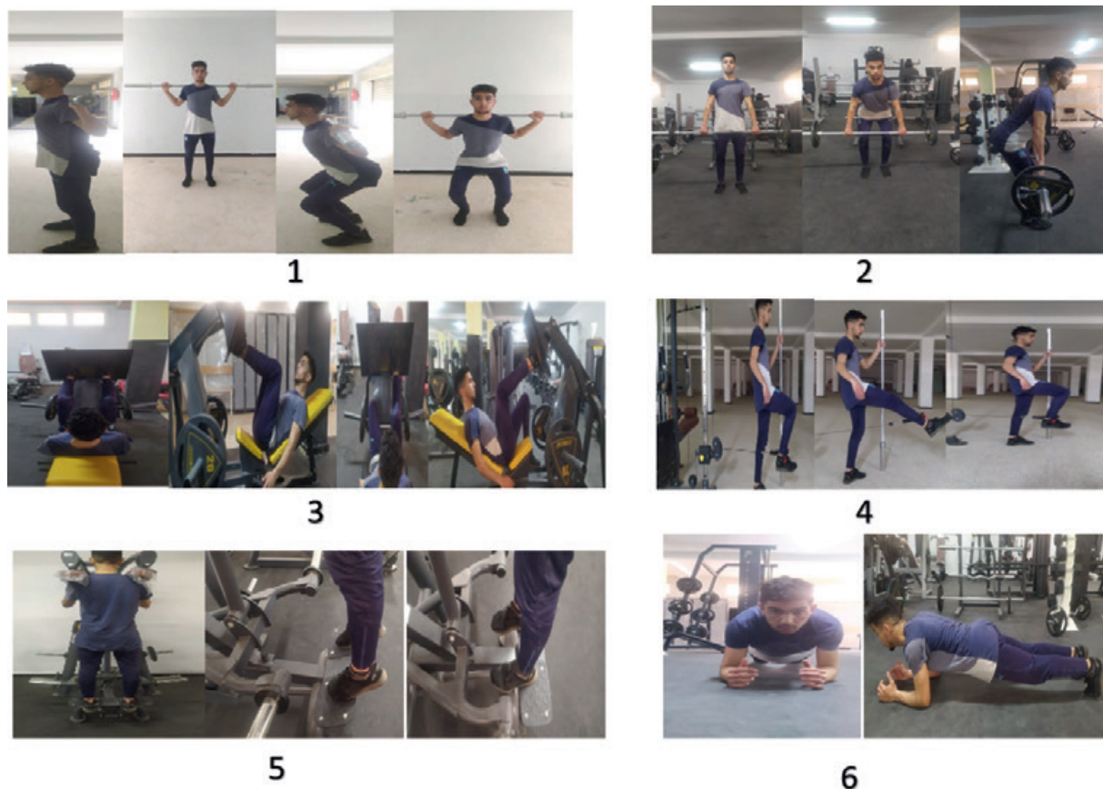
Figure 2. Training action exercise

Note: Lift actions exercise: half squat, Romanian deadlift, auxiliary actions: one-foot leg push, Standing Hip Flexion with Cable, lift Heel, toe lift, Body Plank exercise, HIIT: high intensity Interval training